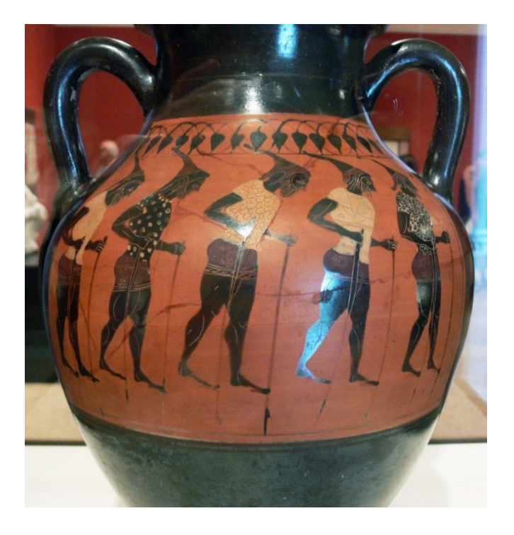
Image 2: Vase depicting a male chorus, Athens, 6<sup>th</sup> century BCE.

Choral performances like the ones at the Greek theatre festivals were simultaneously religious and civic in nature: public performance and religious service went hand in hand, and together shaped and affirmed communal identity.<sup>132</sup> As Plato's aforementioned remark about choros education suggests, choral training was undertaken by all educated members of society, and those participating in the choroi during festivals were regular citizens rather than professionals. Generally, the choroi at these occasions were either all-male or all-female, while non-religious settings also saw choroi of mixed gender.<sup>133</sup> The genre of poetry generally determined what type of choros was required: partheneia , for example, were performed by female adolescents while paeans were performed by men.