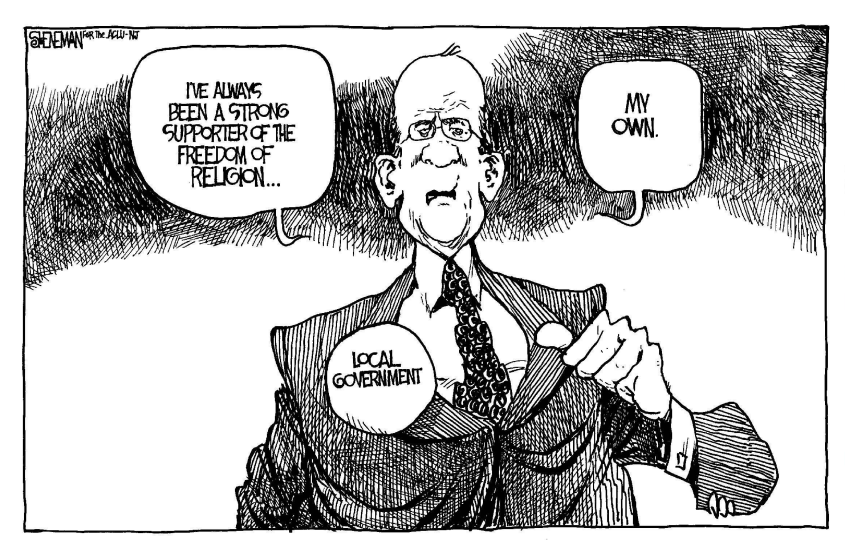
Figure 1. Cartoon by American Civil Liberties Union of New Jersey