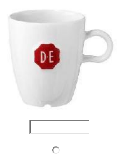
Blokker Koffie kopjes, 2 stuks. Totaal €2,10.

Douwe Egberts Koffie kopjes, 2 stuks Totaal €7,90.